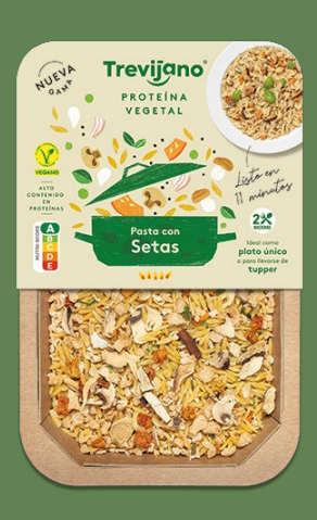
Pasta with Mushrooms