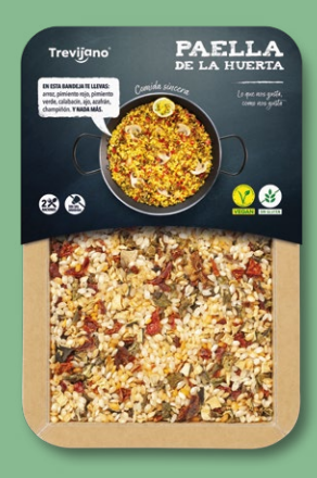
Paella from the garden