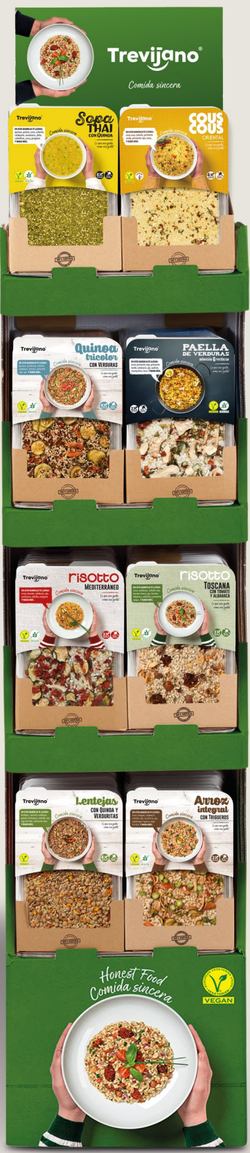
WOODEN DISPLAY 8 CASES (12 units) 41 x 40 x 178 cm