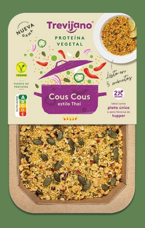
Thai style Couscous