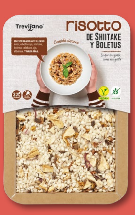
Shiitake & Porcini