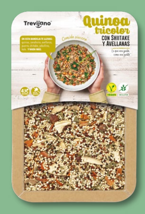
Tricolor quinoa with Shiitake mushrooms and hazelnuts